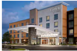
Fairfield Inn by Marriott