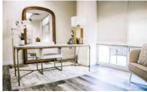
CaptivatingU Med Spa