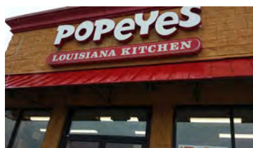
Popeye's Louisiana Kitchen