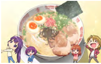
Genki Ramen & Teppanyaki