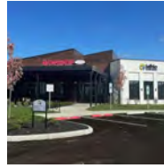
Telhio and Crimson Cup