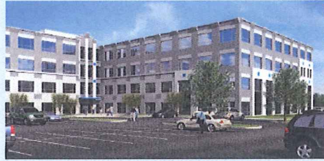
GE Aviation Campus

GE Aviation , a world-leading provider of commercial and military jet engines and components, leased an additional 4,525 square feet of Class A office space at 9050 Centre Pointe Drive in the Centre Pointe Office Park (Downtown). GE Aviation leases a total of more than 500,000 square feet of Class A space in the Union Centre area (Downtown). www.geaviation.com