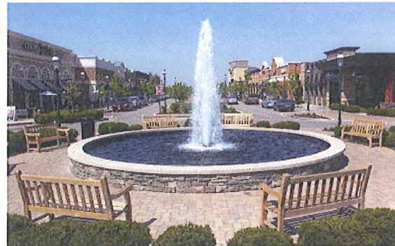
The Streets of West Chester

LOFT, a part of the Ann Taylor brand and a division of Ann Inc., will join j.jill, Chico's and Barnes & Noble, as well as entertainment venues The Rave, Mitchell's Fish Market, Bravo's and P.F. Chang's and other national brands to name a few.