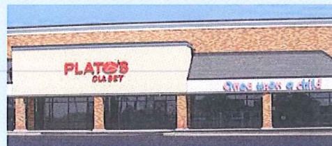
Beckett Commons Center

Clothes Mentor , a woman's fashion resale shop, will open a 5,025 square-foot store at 8154 Princeton-Glendale Road/SR747 in the Beckett Commons Center. Clothes Mentor is slated to open to customers in September. www.clothesmentor.com