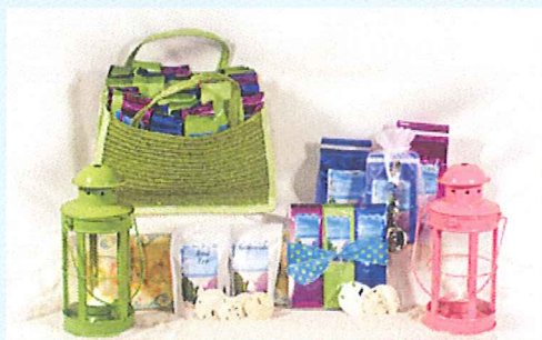
LaCrema Coffee Company

Joerns, LLC , collaborates and partners with medical providers to bring a diverse portfolio of healthcare products and services. The company leased a 4,200 square-foot facility at 9641 Inter-Ocean Drive off Muhlhauser Road. www.joerns.com