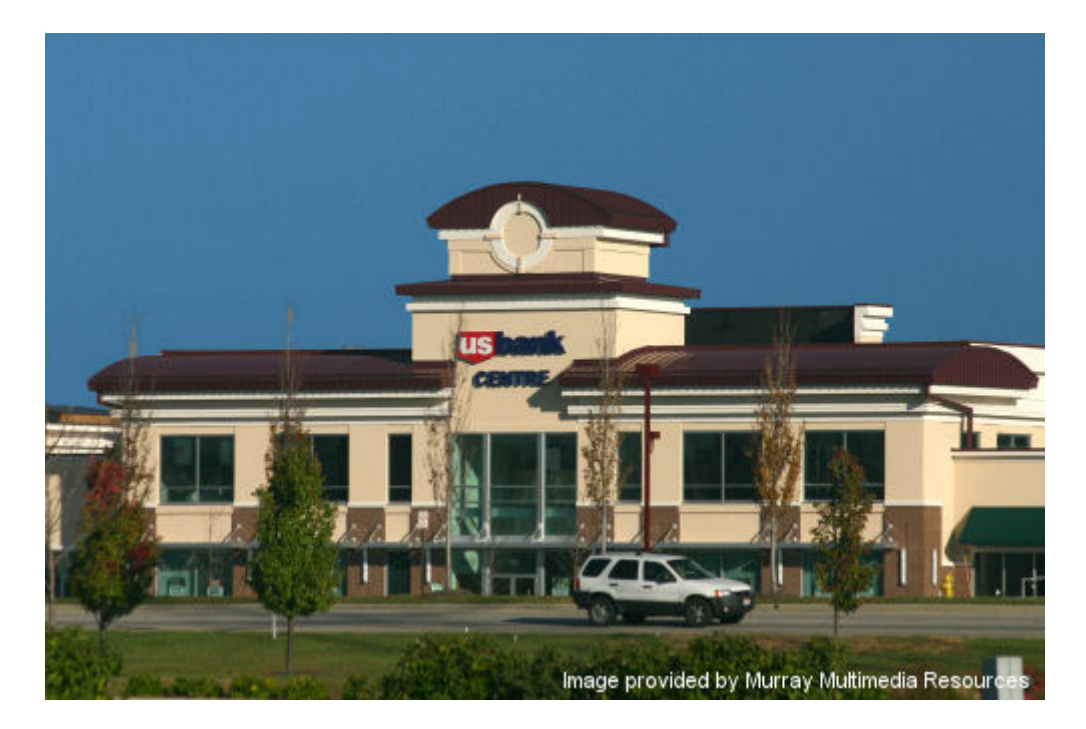
Scottrade At US Bank Centre

Sutton Bank , an independent community bank, announced it will open a commercial lending office on Union Centre Boulevard in Chappell Crossing (Wellington building). <u>www.suttonbank.com</u> or <u>www.chappco.com</u>