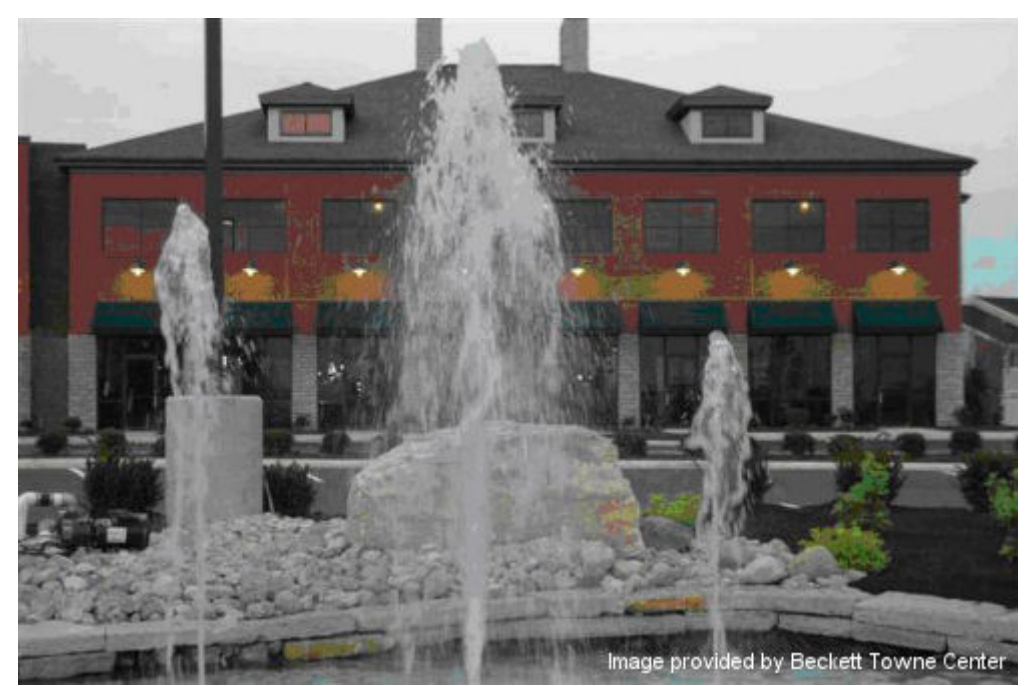
Beckett Towne Center

Century 21 Thacker & Associates , a full service real estate company, announced it will relocate its existing West Chester office in February to a 4,843 square foot facility at 9069 Cincinnati-Dayton Road at West Chester Road. <u>www.donnathacker.com</u>