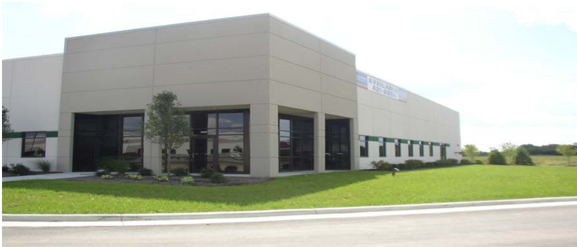
FASTEMS At Union Commerce Center

FASTEMS , a factory automation supplier and recognized partner for the paper and plastics industries, announced in January 2006 it leased a 4,000 square foot facility at 9850 Windisch Road in RGW Development's Union Commerce Center off Allen Road. www.fastems.com