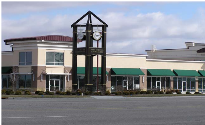
Chipotle at West Chester Town Centre

Chipotle , specializing in gourmet burritos and tacos, announced a new 2,679 square foot restaurant at 9324 Union Centre Boulevard in West Chester Town Centre at Muhlhauser Road and Union Centre Boulevard (next to US Bank) in January 2006. www.chipotle.com or www.schumacher-dugan.com