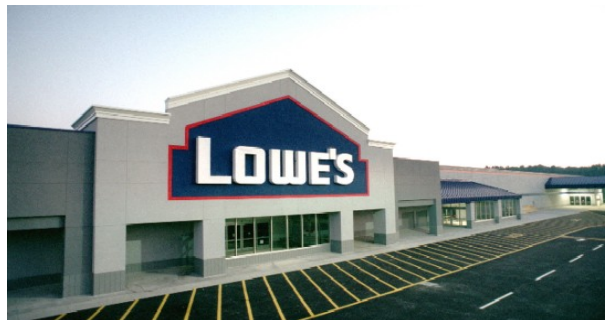
Lowe's At Tylersville Square

Lowe's , national home improvement retailer, announced in January 2006 it will build a 117,000 square foot center on the site of the former Wal-Mart facility in Tylersville Square at Interstate 75/Tylersville Road. Lowe's is ranked 43rd on the Fortune 500. www.lowes.com