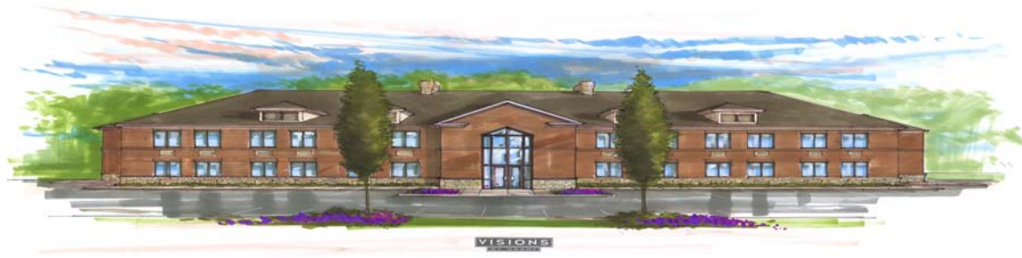
Beckett Towne Center By OBC Development

Tepe Financial Services , financial planning and investments, announced in January 2006 it will open an office at 8354 Princeton-Glendale Road/SR 747 in the Beckett Towne Center north of Union Centre Boulevard. www.beckettownecenter.net