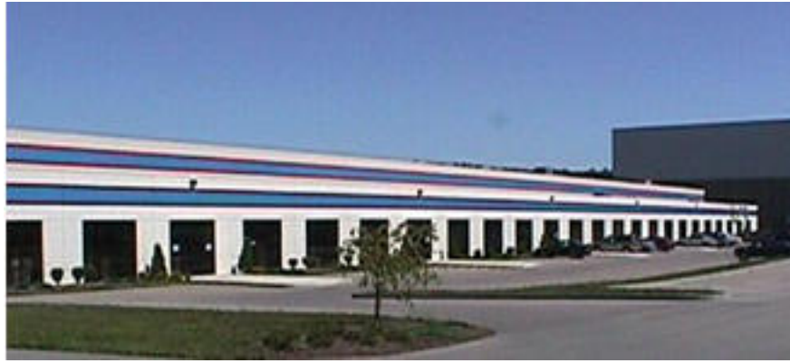
Gutter Champ At West Chester Commerce Center

Hunt Hardwood Flooring , custom installation, refinishing and repair services, leased a facility at 8374 Princeton-Glendale Road/SR747 in the Beckett Towne Center north of Union Centre Boulevard. www.beckettownecenter.net