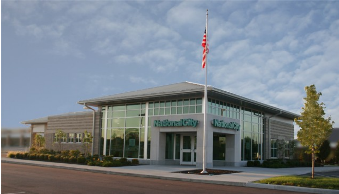
National City Bank at Highlands Developed by Neyer Properties

Cincinnati-Dayton Road in Neyer Properties' Highlands development anchored by Wal-Mart Supercenter. This will be National City's 3 rd West Chester branch. www.nationalcity.com or www.neyerproperties.com