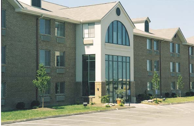
CMC Office Park (Beckett Ridge)

Carousel Home Furnishings leased a 2,490 square foot retail facility during September 2005 at 4872 Union Centre Pavilion Drive in the Union Centre Pavilion anchored by Bigg's.