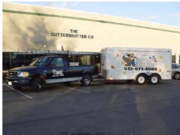
The Gutter Shutter Company

Gutter Shutter Company (The) , specializing in leaf, debris and gutter systems, announced in September 2005 a 4,600 square foot expansion to its existing facility at 866 East Crescentville Road. www.guttershutter.com