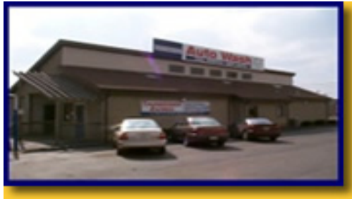
Thunderbird Auto Wash

7873 Kingland Drive off Tylersville Road during September 2005. www.thunderbirdautowash.com