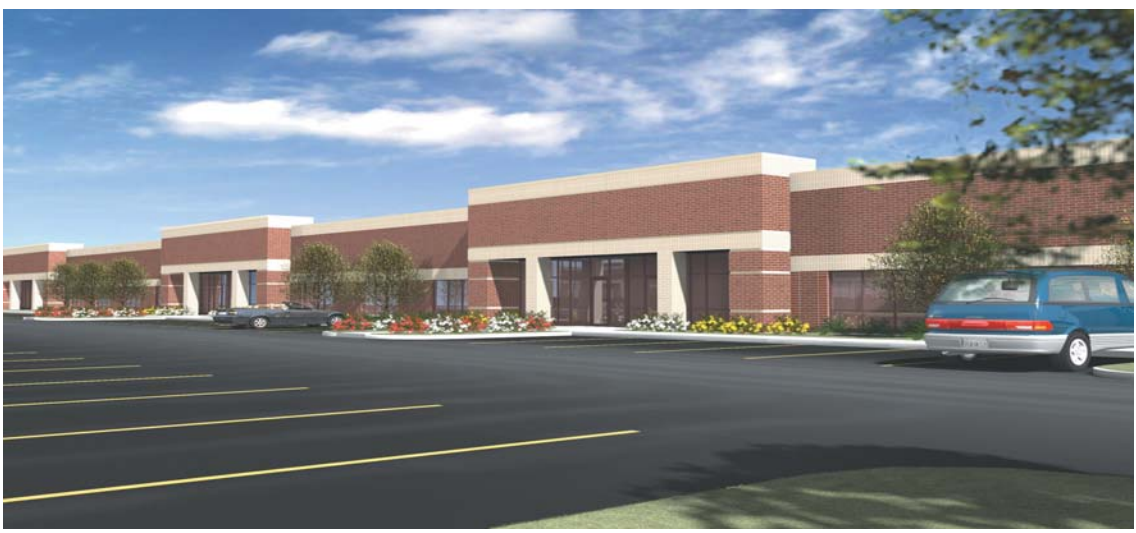
Inter-Tel Technologies World Park at Union Centre

Kemba Credit Union , offering a broad range of financial products and services to Butler, Hamilton and Clermont County residents, announced in May 2005 it will build a new four-story, 32,000-square-foot office building in the Chappell Crossing development on Union Centre Boulevard. The building will house Kemba's 7<sup>th</sup> full-service branch, featuring multiple drive-up teller windows and ATM, and offering office space for lease. Schumacher Dugan Construction will break ground on this project July 2005 with an expected completion end of first quarter 2006. Visit Kemba at <u>www.kembacu.org</u>.