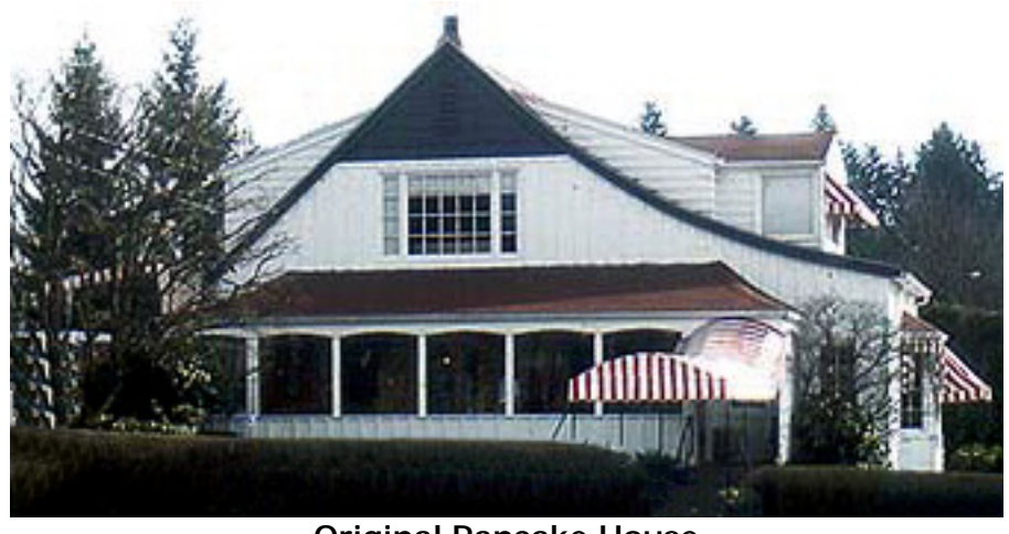
Original Pancake House Streets of West Chester

Quality Custom Framing leased a 465-square-foot facility at 8050 Beckett Center Drive in CMC Beckett Office Park off Princeton-Glendale Road/SR747 during May 2005.