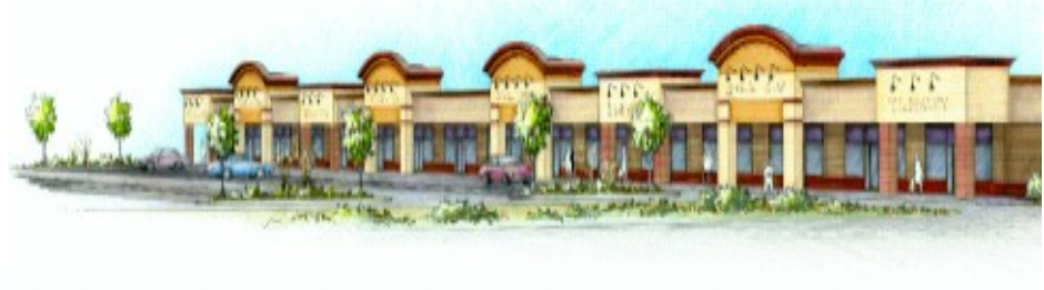
The Shoppes at Rialto Place

Shoppes at Rialto Place (The) , a new 30,000-square-foot retail development is being developed at 9300 Princeton-Glendale Road/SR 747 on the northeast corner of Rialto road. The retail center is expected to open by December 2005.