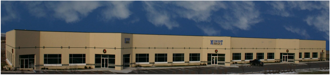
Edy's Grand Ice Cream/Schumacher Commerce Park Building #7

G's Apparel , clothing store, announced in November 2004 it will lease an 875-square-foot facility at 7324 Kingsgate Way off Tylersville Road.