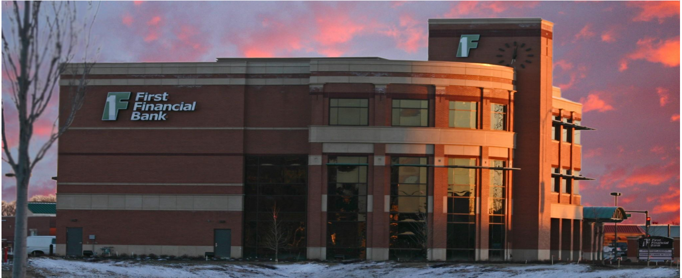
First Financial Bank Banking & Office Center at Union Centre Boulevard

First Financial Bank will open its new banking and office center at 9120 Union Centre Boulevard on December 27 th . (First announced 2003. Visit www.westchesterdevelopment.com/projects for more information.)