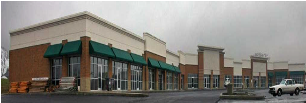
Tylersville Corner Developed By Midland Atlantic

Buddy's Carpet , the tenth largest specialty flooring company in America, announced in October 2004 it will open a 3,200-square-foot retail facility at 7721 Cox Lane in the Tylersville Corner retail center being developed by Midland Atlantic.