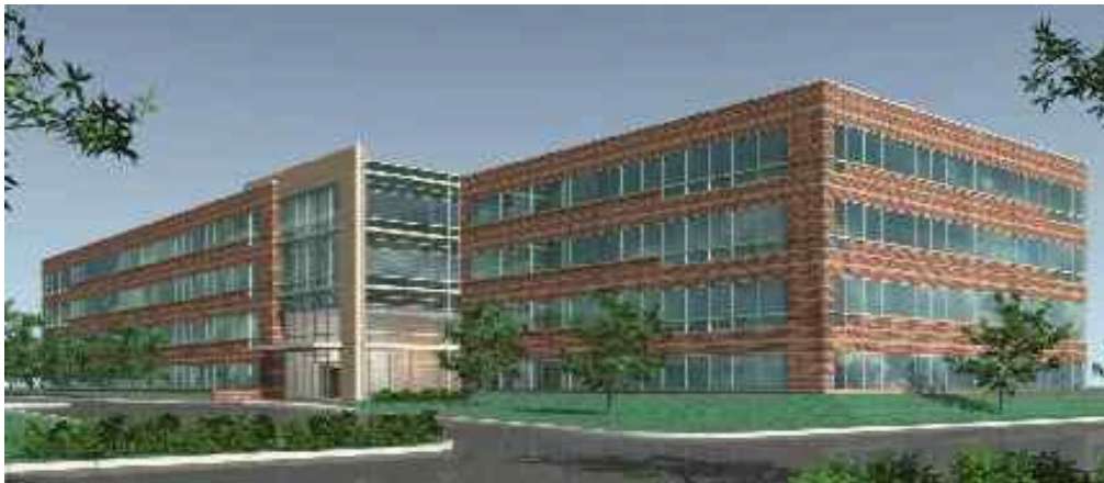
American United Life / Duke Realty's Centre Pointe Office Park

American United Life Insurance Company opened an office at 9050 Centre Pointe Drive in the Centre Pointe Office Park during October 2004. The Centre Pointe Office Park buildings are now owned, leased and managed by Duke Realty.