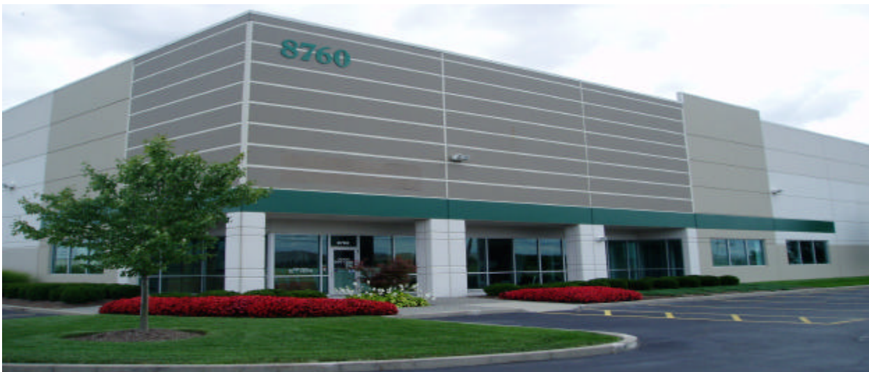
MMI Products, Inc. / ProLogis Park West Chester

MMI Products, Inc. , a leading manufacturer and distributor of products used in North American public infrastructure and commercial/residential construction, leased a 24,000-square-foot facility at 8760 Global Way in ProLogis Park West Chester on Union Centre Boulevard during October 2004.